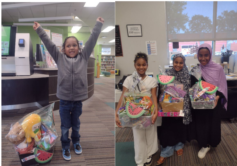
Photos: Winners of the summer reading drawing at Bornt and Mont Pleasant were excited to receive their gift baskets for completion of the program!